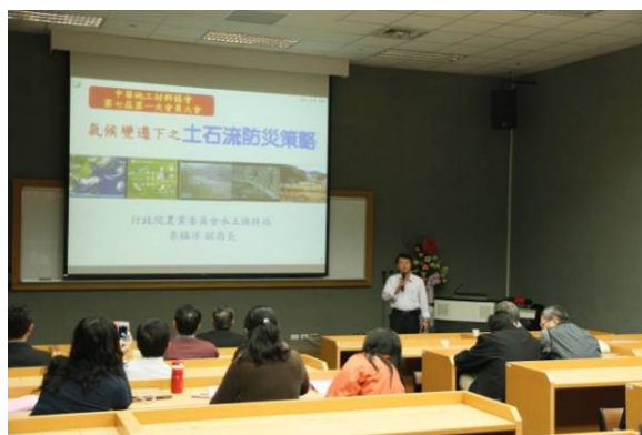
Zheng-Yang Lee, the deputy chief of Soil and Water Conservation Bureau, Council of Agriculture, Executive Yuan.