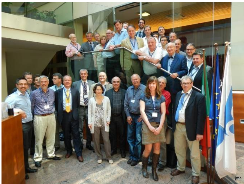
Participants to the plenary session of the CEN TC 189 meeting in Milano