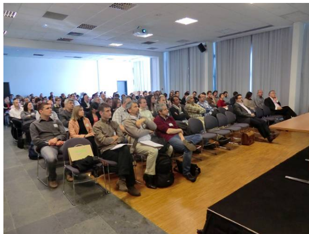
Attendance during the session on erosion control

Reported by Nathalie Touze, French IGS Chapter Correspondent