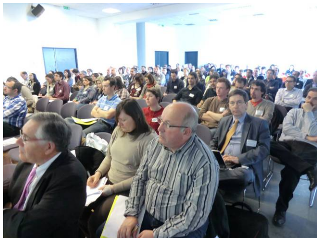
Attendance during the preliminary courses on geosynthetics

Also, the participation of practitioners was encouraged since presentation of case histories was, as usual, a substantial part of the program. The 16 exhibitors could get interesting contacts with the participants.