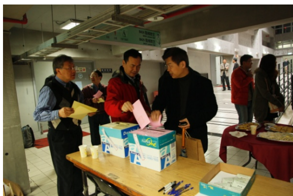
Board re-election meeting