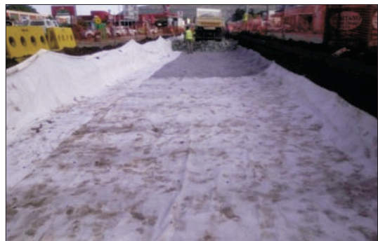
RockGrid PC reinforcing laid in trench