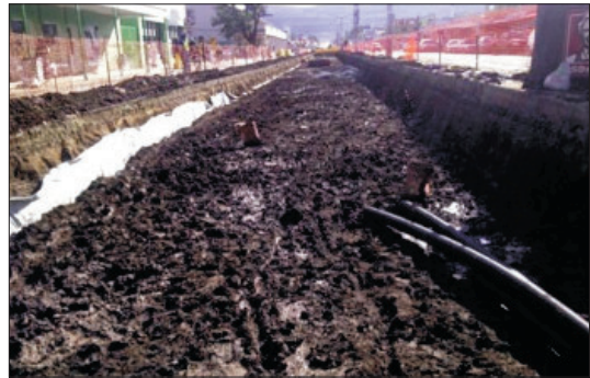
Waterlogged box cut

Creep reduces tensile strength in long-term behavior in many polymers used for reinforcing products (Ref SANS 207: "The design and construction of reinforced soils and fills"), however, the high-strength multifilament polyester yarns in RockGrid PC demonstrate a very low creep tendency.