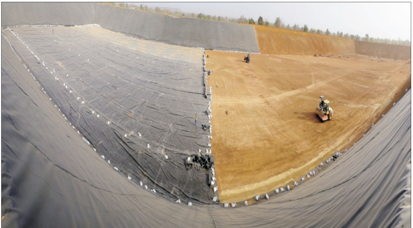
Gundle's geomembrane installation in Burkina Faso. This is a 1.5 mm thick HDPE geomembrane for a tailings facility application.

One such project is Gundle's contract in Burkina Faso, located some 300 km from Ouagadougou, the capital. This involves the installation of HDPE Geomembranes for tailings facilities, raw water storage and heap leach pads.