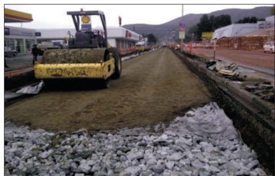
G5 subbase placed on reinforced layer

Due to the permittivity and transmissivity characteristics of the needlepunched nonwoven carrier fabric, this product also provides good filtration and drainage characteristics, facilitating the reduction of pore water pressure and improving the soil shear characteristics, thereby increasing stability.