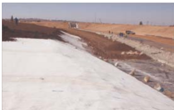
Bentofix NSP recently being installed at Lufhereng Attenuation Ponds, Soweto.