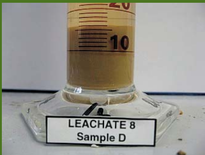
Figure 1 - Swell index test, target swell 24ml/2g.

Site specific leachates will not necessarily be available at design stage, except in the case where design is for extensions to, or replacements for, existing landfill sites. In the case of a new site where leachate has not yet been generated, designers are cautioned that bentonite compatibility testing with synthetic leachates may be an un-conservative approach, or may even be overly conservative. In addition, making judgements of compatibility based purely on chemical composition of the leachates should be avoided, as experience has shown apparently similar leachates to produce significantly different swell indices with different bentonites.