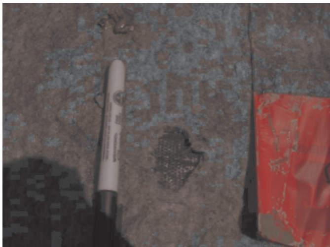
Figure 1. Hole in GCL with bentonite eroded away

An 800 m 2 1 m deep pond with a GCL liner was leaking about 150,000 litres of water per day. When investigated the GCL was found to be placed on a 150 mm drainage layer of slatey stone with particle size ~20 mm. There was a monolayer of pebbles on top of the liner since the designer did not appreciate the need for a confining pressure. In addition there were many limestone rocks in and around the pond. The subgrade punctured the lower geotextile in many places and the bentonite eroded away. There was no chance for the bentonite to seal any holes since it was already fully hydrated and expanded. Although not tested ion exchange of sodium ions in the bentonite by calcium ions from the limestone was a given. Even if there had been a uniform compacted subgrade under the GCL sealing would still not have occurred, due to the lack of confining pressure. Conversely to what many people think, the hydrostatic pressure on the GCL does not provide the required confining pressure.