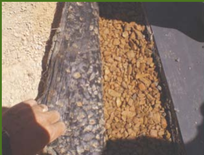
Figure 2. Subgrade aggregate and punctures in floor membrane.

The situation would have been better had the GCLs been placed with the film up, as is the case with most composite liners — geomembrane on top, GCL or compacted clay liner underneath. This way the more impermeable component, the film, would not have been punctured first. The GCL would have cushioned the membrane and the geomembrane could have imparted the full hydrostatic head (~4 m) to the confining pressure of the GCL, had the subgrade not been so rough with aggregate peaks and void space between them.