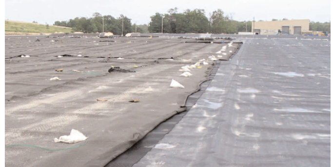
Figure 2 – PermaNet UL Geocomposite Being Installed at Cape May Landfill

The Cape May Secure Sanitary Landfill has a total footprint area of 95 acres divided into several contiguous cells. Cell 1F is currently under construction and has 18 acres of double composite liner system as shown in Figure 1. This liner system was installed on a \pm 2\% slope with GSE PermaNet UL geocomposite used as the primary and secondary drainage layers.