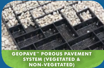
GEOPAVE™ POROUS PAVEMENT SYSTEM (VEGETATED & NON-VEGETATED)