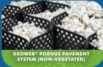
GEOWEB® POROUS PAVEMENT SYSTEM (NON-VEGETATED)