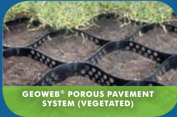
GEOWEB® POROUS PAVEMENT SYSTEM (VEGETATED)