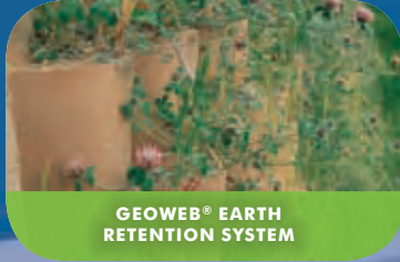
GEOWEB® EARTH RETENTION SYSTEM