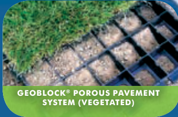
GEOBLOCK® POROUS PAVEMENT SYSTEM (VEGETATED)

Select a suitable building site and design the building with a minimal footprint to minimize site disruption.