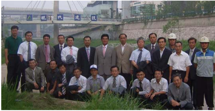
Introducing the Korean IGS Chapter Officers in Seoul, Korea.