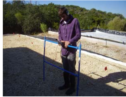
Electrical Resistivity Testing Provides Quality Insurance!

Please Visit us in booth 513 at Geosynthetics 2009 Feb 25-27 Salt Lake City