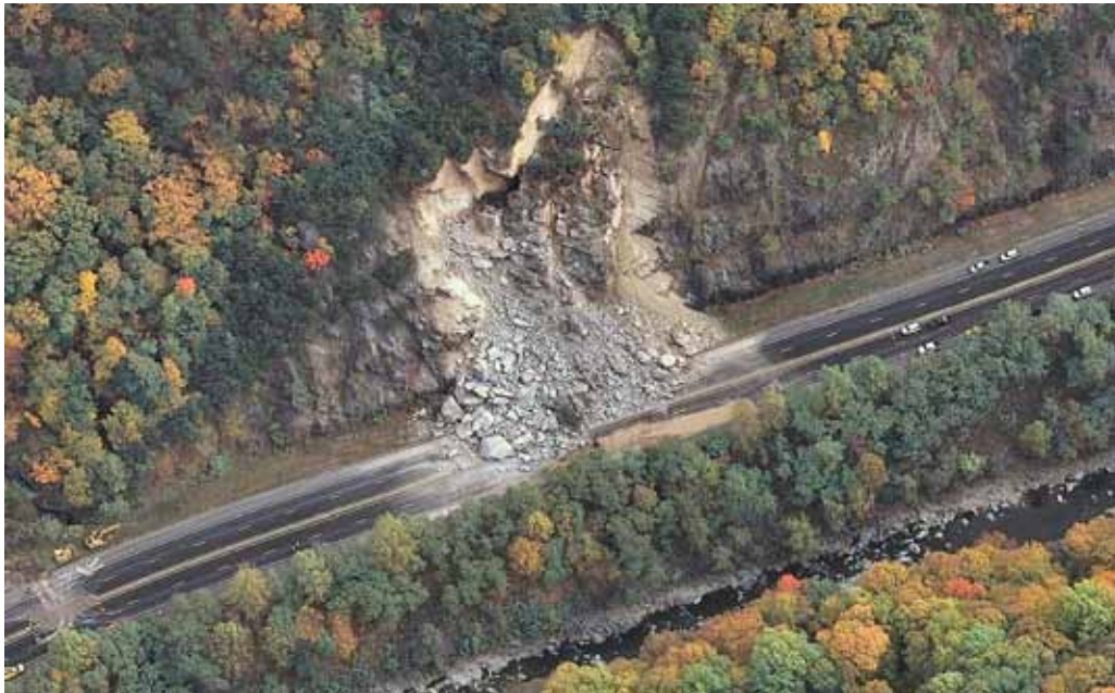
A rockslide in October 2009 closed Interstate 40 in North Carolina for nearly six months.