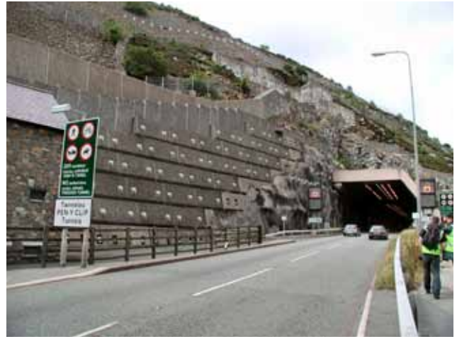
Multiple rockfall protection systems installed near the Pen-Y-Clip tunnel on the A55 North Wales Expressway, United Kingdom.

References to specialized and hard-to-obtain sources, however, were avoided as much as possible.