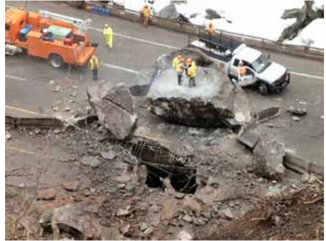
Large rockfall blocks severely damaged a bridge deck on Interstate 70 in Glenwood Canyon, Colorado, closing the highway for four days and leading to extended travel restrictions.

Chapter 5, Rockfall Risk Assessment and Risk Management , by A. K. Turner, describes alternative approaches to assess risks posed by rockfall hazards, including the evaluation and quantification of rockfall hazards and risks and the selection of rockfall mitigation measures.