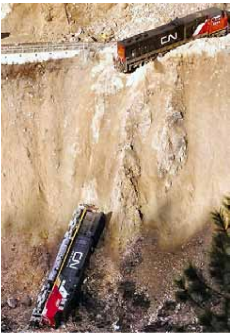
Railroad derailment caused by a small-volume rockfall near Lytton, British Columbia, Canada, January 2007.

Several agencies have modified the RHRS to reflect specific topographic, climate, or geology characteristics, or to expand its evaluation of mitigation alternatives and possible economic impacts of rockfall events. Chapter 4, Implementation of Rock Slope Management Systems , by L. A. Pierson and A. K. Turner, provides details of eight systems that have made significant adjustments to the original RHRS.