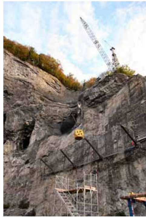
Walenstadt test facility, Switzerland.