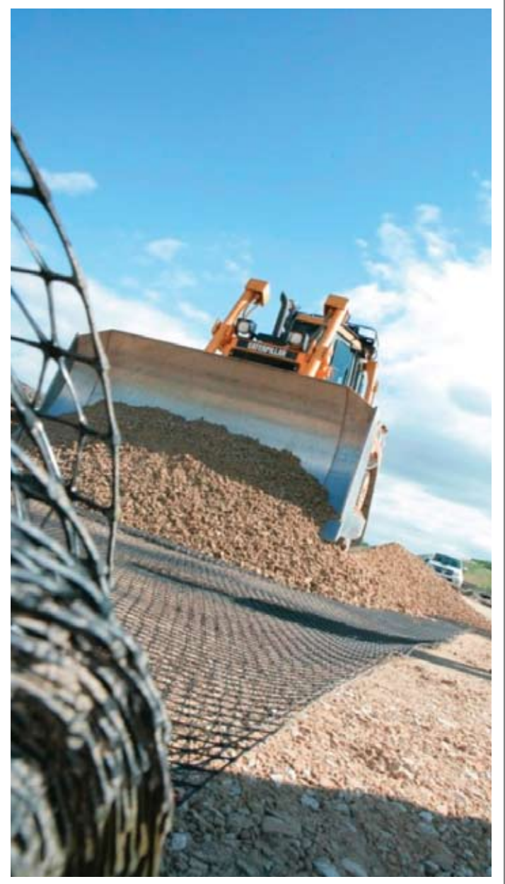
For a new link road built by Costain over marshland near Wakefield, the performance of Tensar TriAx™ demonstrated clear performance advantages

To continue the recipe metaphor – using a set of pre-dictated ingredients and methods does not necessarily guarantee the tastiest cake available. In their Performance Specifications Strategic Roadmap: a Vision for the Future (2004)<sup>1</sup> the US Federal Highways Administration points out that method-based specification 'could not deal with rewarding a contractor for "better-than-minimum practice";' and '...could not consistently deal with work that was outside the bounds of "reasonably close conformance".' Method specification 'inhibited innovation' and there is no incentive for a project manager to consider 'departures from standards' and 'departures from procedure'.