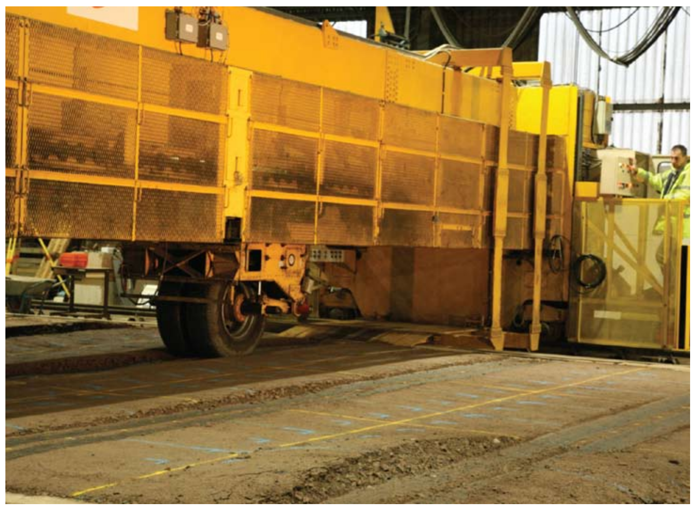
Extended trafficking testing performance trials at the Transport Research Laboratory are an essential part of demonstrating the in-ground performance of geogrids such as Tensar TriAx™.

While materials such as geogrids must meet the quality tests required by CE conformance and BS test requirements, it must be remembered that these are only base level quality tests of certain physical parameters. The tests do not measure what happens when the materials are put under load in the ground. Only actual in-situ performance trials can truly demonstrate how the combined design and material meet the inherent variability of ground conditions.